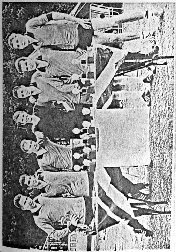
(1) 1966 : Rheindahlen Garrison 6-a-sides - Earliest photo on record (3) 1976/77 : North Rhine Cup Winners